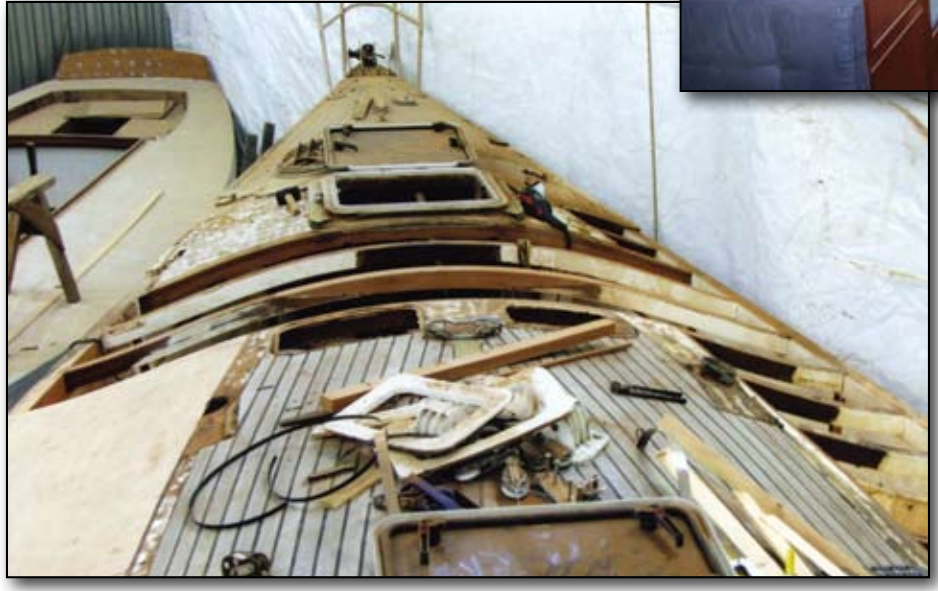
Her restoration was a labour of love as much rotted timber had to be replaced.

The boat might have been in a poor condition, but worse was to come. Wheeler had to fly back to England and left her in the hands of a marina whose management agreed to look after her on